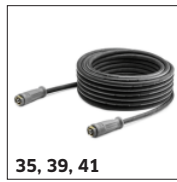
35, 39, 41